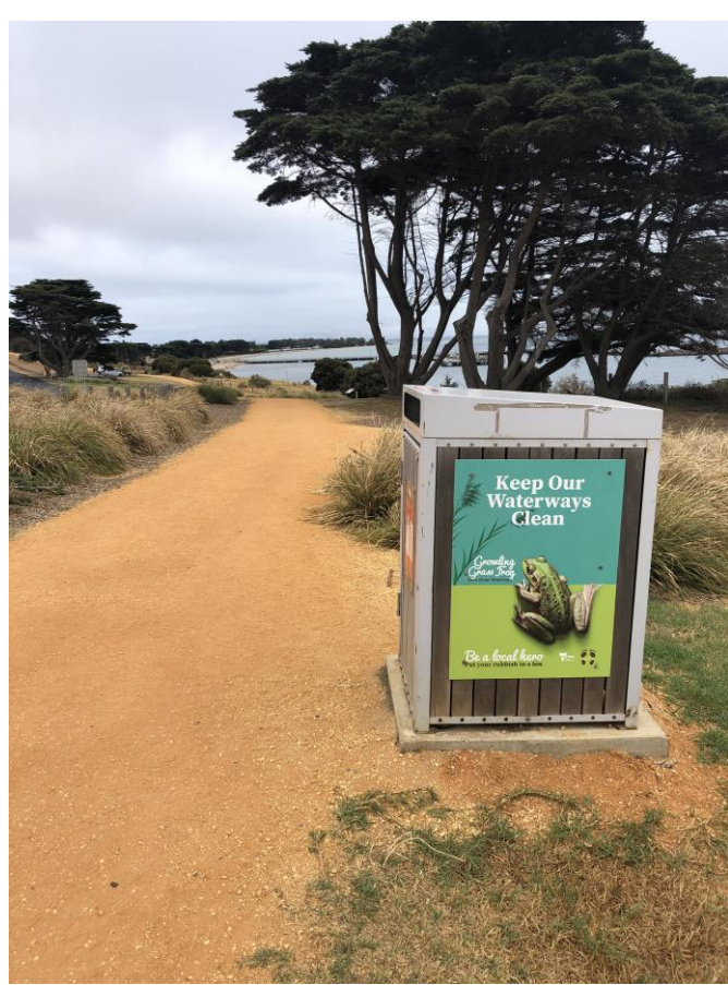
Above: All Triathlon entrants ran past the 'Heroes of the Bays' Posters along the run section of the race