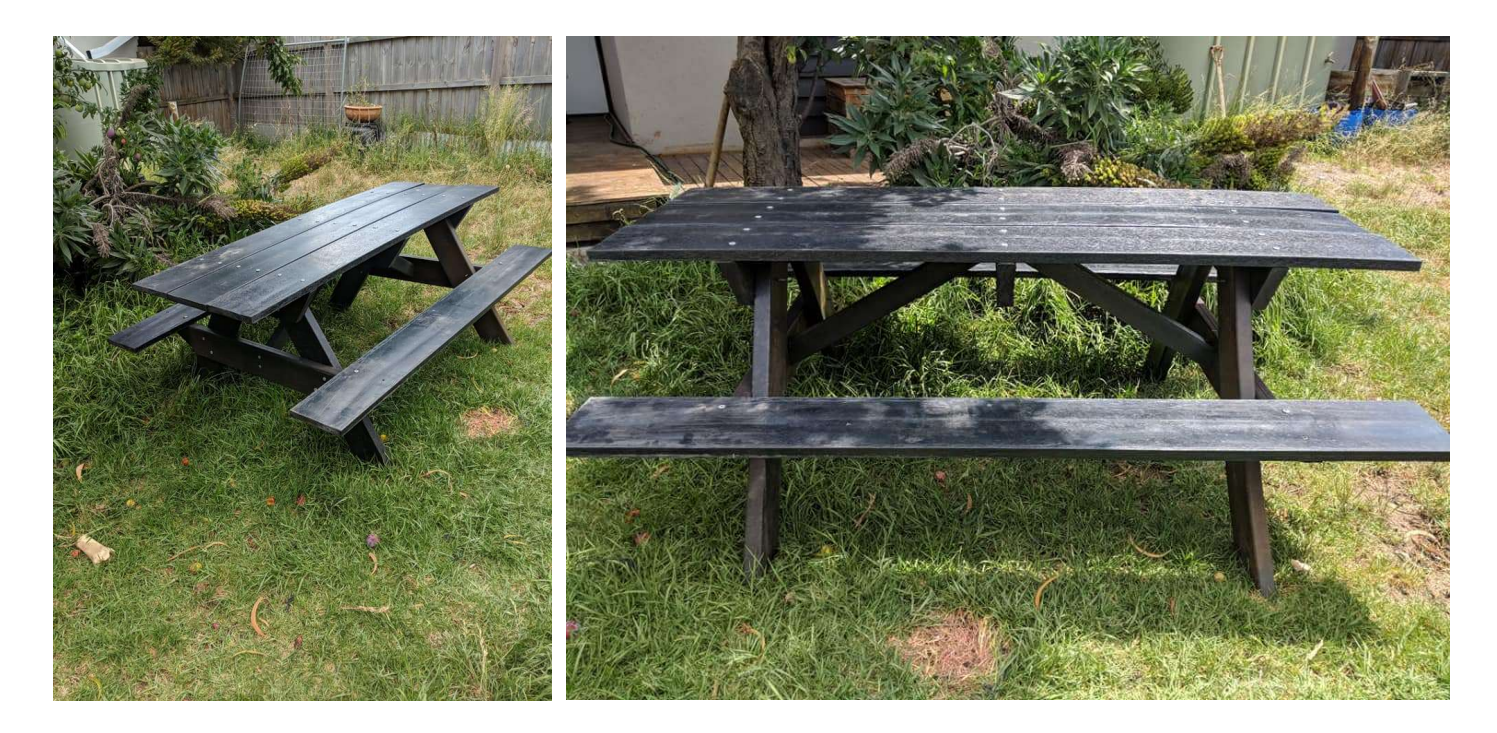
Image 1. 'Park bench' constructed from soft plastics, and other single use plastics that could not be recycled, from Queenscliff Music Festival.