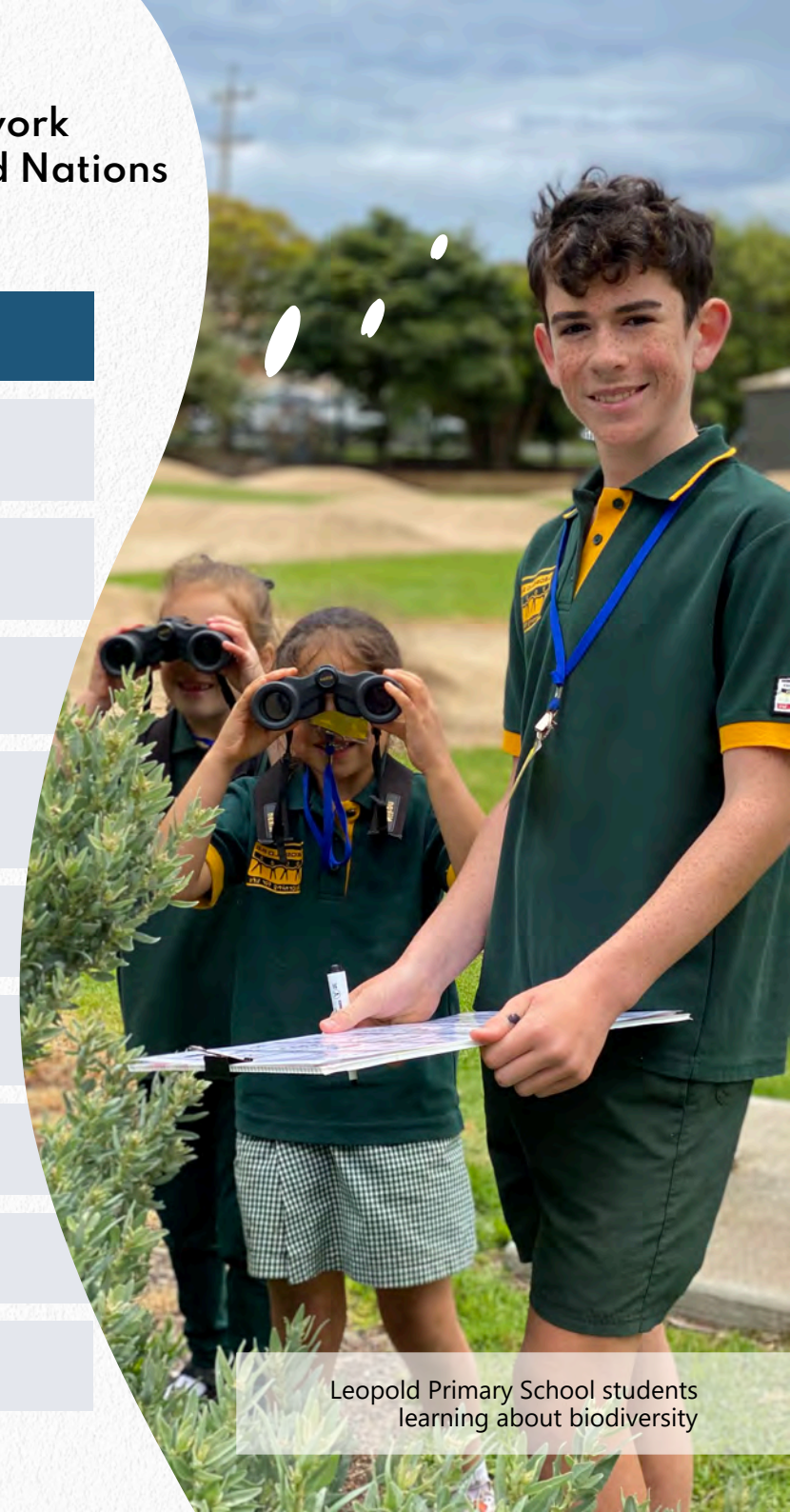
Leopold Primary School students learning about biodiversity

Build relationships and facilitate communication within the network, agencies and partners