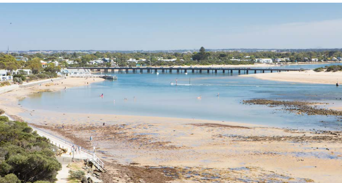
Left: Barwon Heads