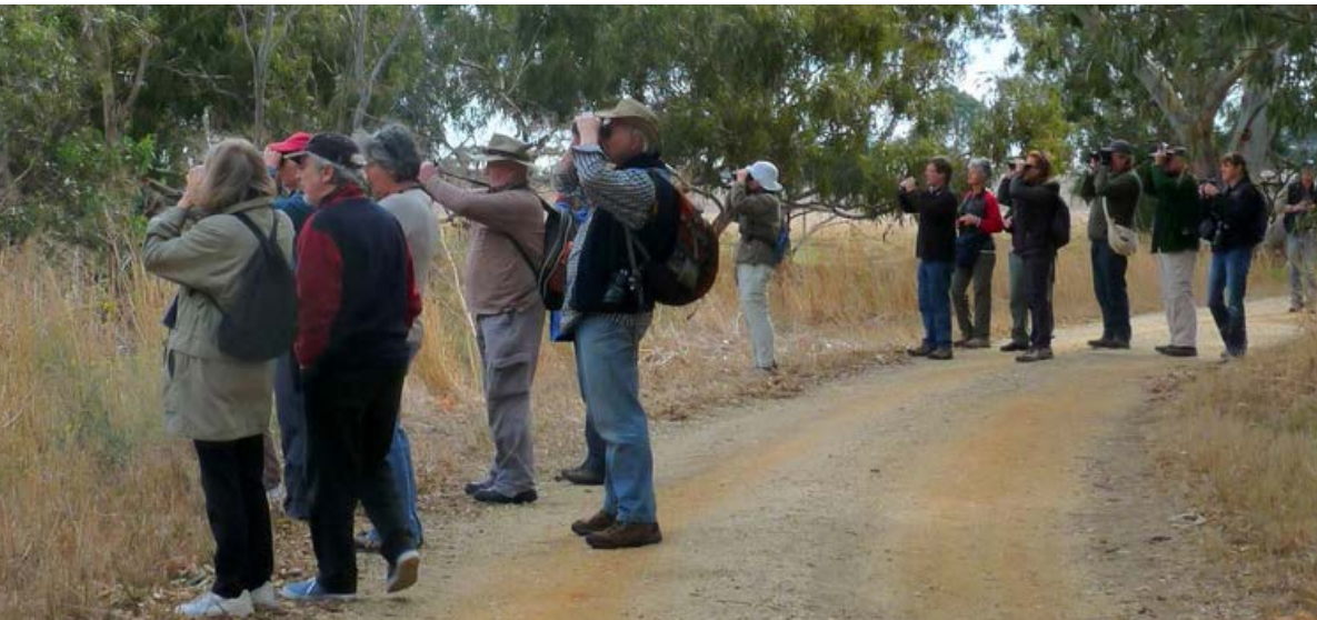
Left: Geelong Field Naturalist Club members on an excursion