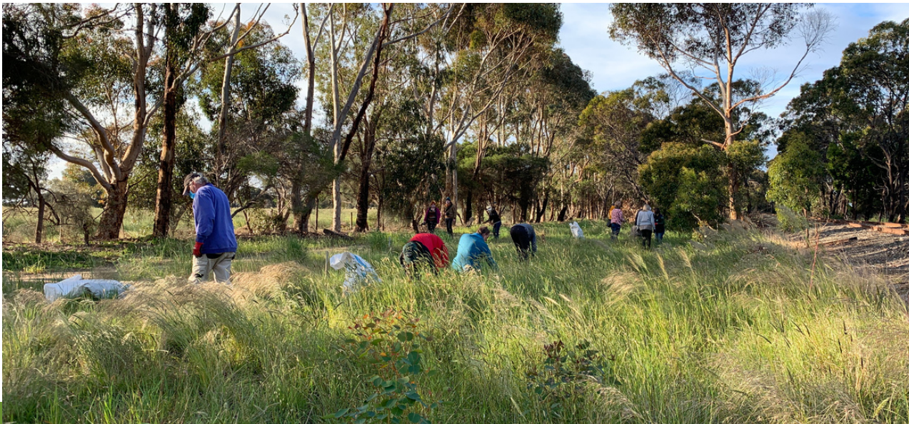
..... Right: Bellarine Landcare volunteers weeding along the Bellarine Rail Trail

Facebook: @bellarinelandcare Instagram: @bellarinelandcare