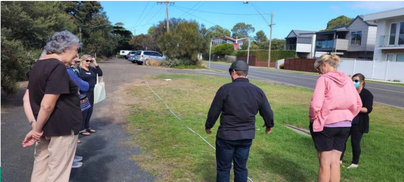
Right: Bellarine Catchment Network volunteers learning how to participate in the Greater Geelong Plastic Pollution Survey

Email: info@bcn.org.au Facebook: @bellarinecatchmentnetwork Website: www.environmentbellarine.org.au