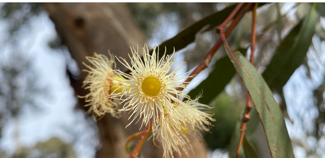
Left: The threatened Bellarine Yellow Gum, Ocean Grove