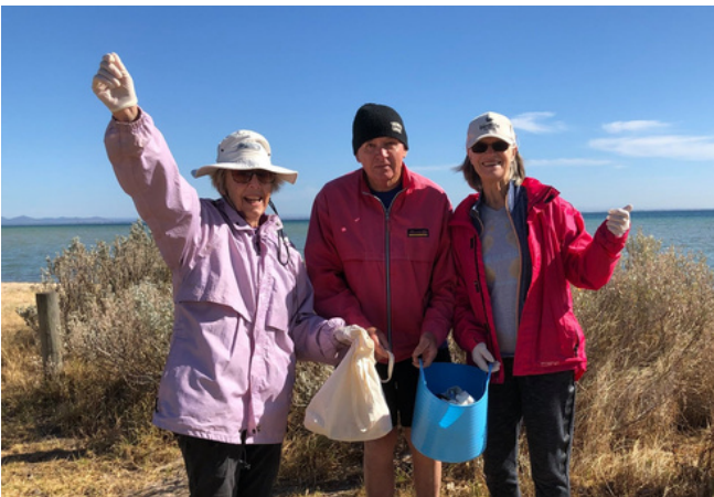
'Friends of' Groups