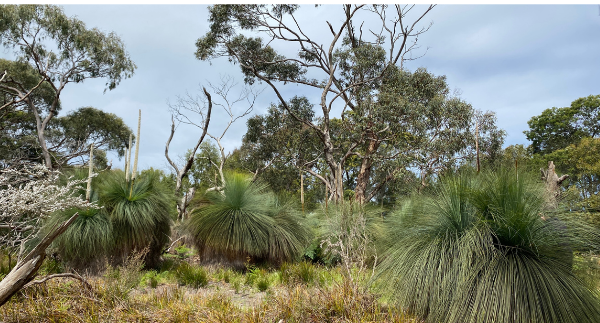
Left: The Basin Reserve, Drysdale