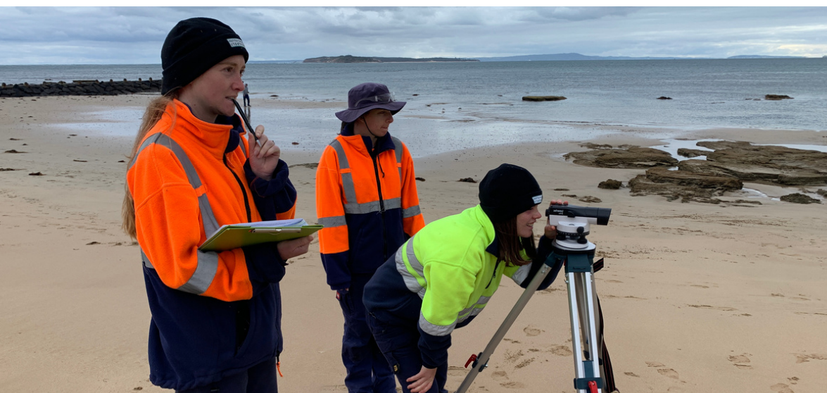
Left: Point Lonsdale Sand Monitoring volunteers measuring sand height at Point Lonsdale front beach.