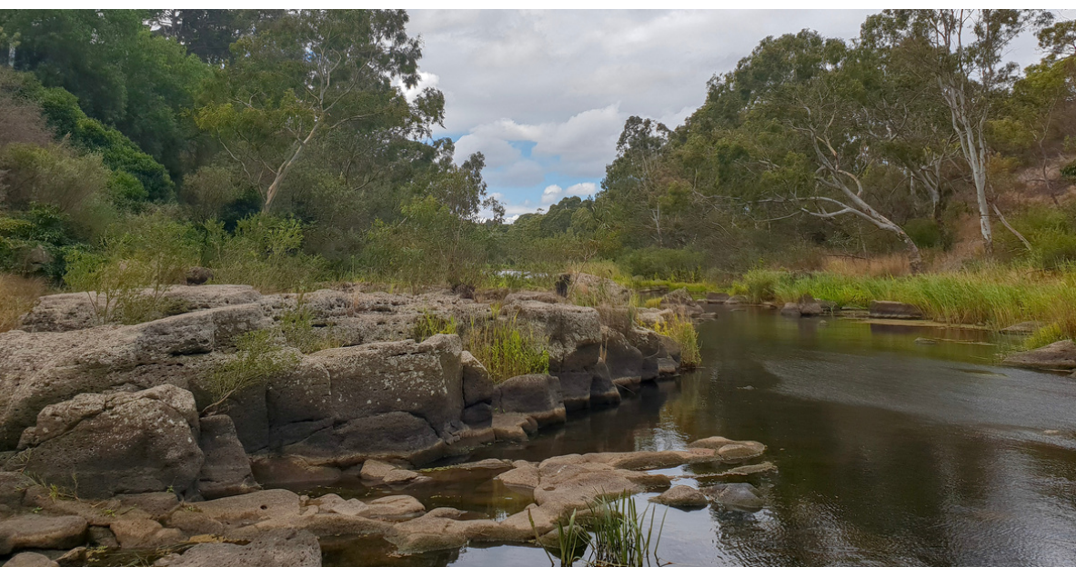
Left: Buckley Falls, Geelong

Website: www.northerlyaspects.org.au/friends-of-cowies-creek/