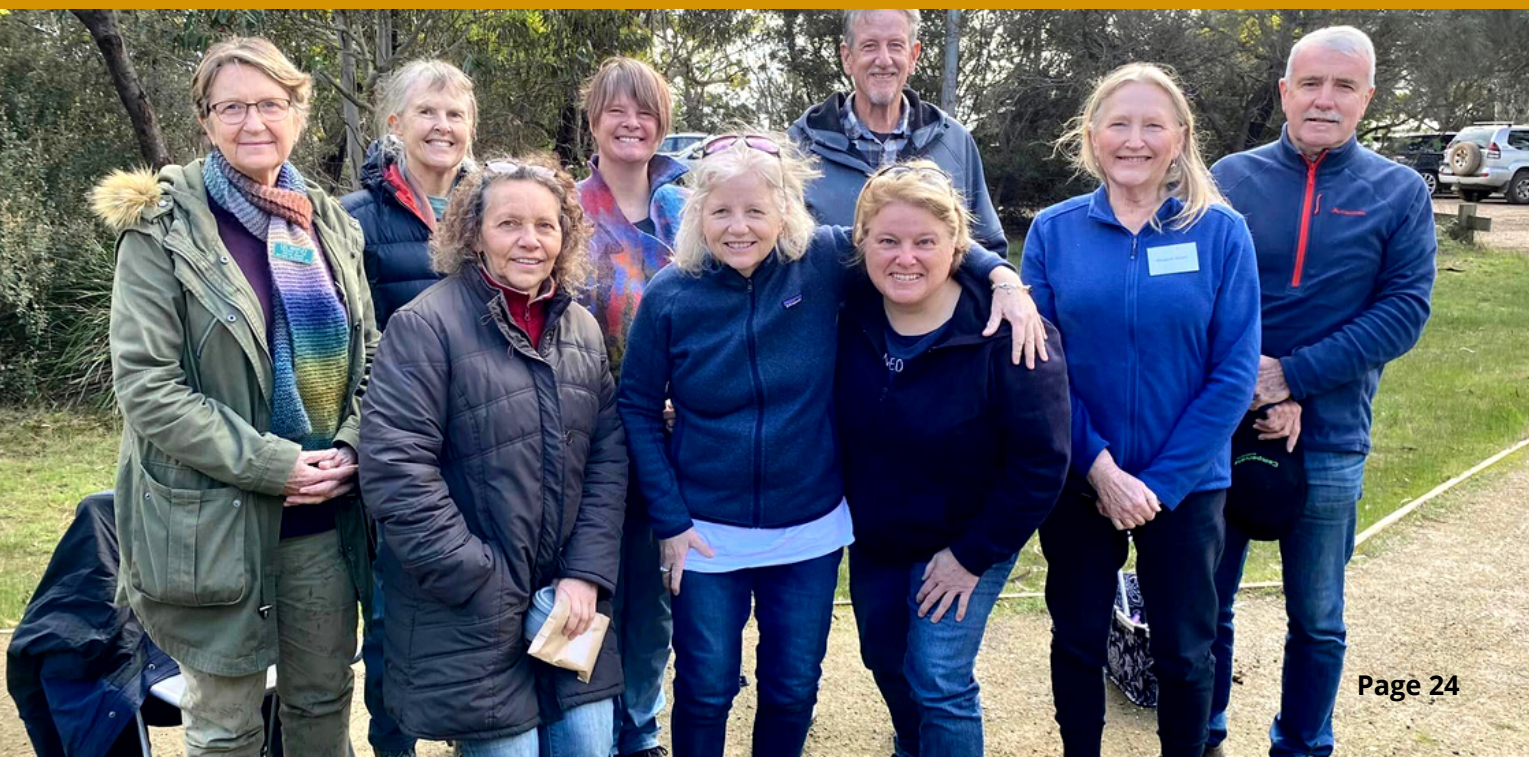
Friends of Ocean Grove members

The group meet for regular working bees on the second last Friday each month at 9am-11:30am. Register via ParkConnect or contact the group directly.