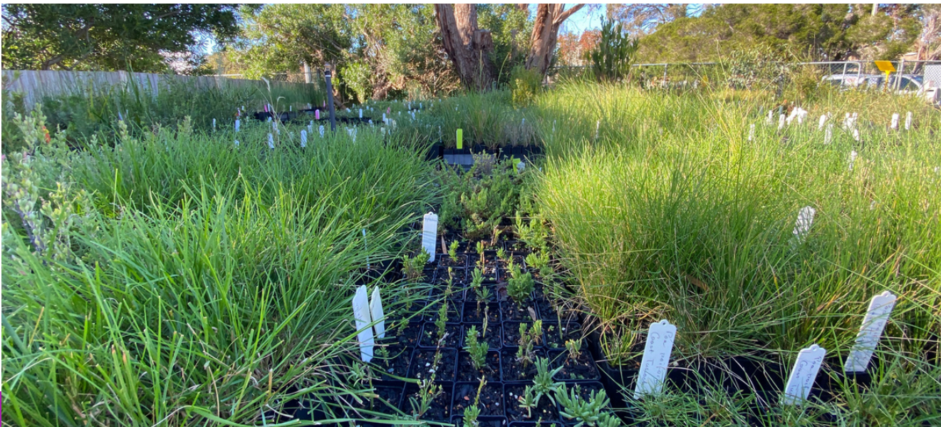
..... Right: The Swan Bay Environment Indigenous Nursery