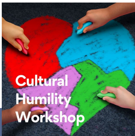
Figure 5 (below): an Instagram post by @bellarinecatchmentnetwork and the accompanying alternative text describing the image to assist people with screen readers

If you work or volunteer for a group that has volunteers, please contact Naomi at naomi@bcn.org.au to register! This workshop is supported by the Victorian Government via the Emerging Stronger program.