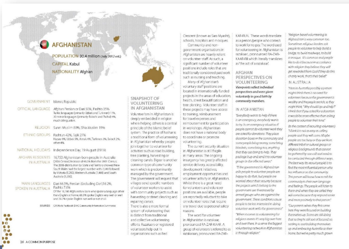
Figure 4 (below): Afghanistan 'Country Profile' featured in the 'A Common Purpose' – Formal Volunteering and Cultural Diversity resource.

Cultural Safety: Principles and Guidelines: a helpful document to create a culturally safe space for all. Click here